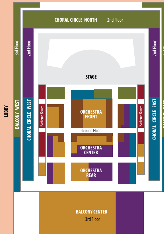
Weill Hall at the Green Music Center